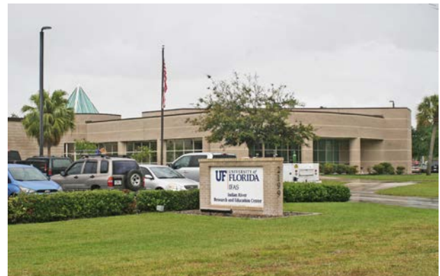
University of Florida IFAS Research & Education Center