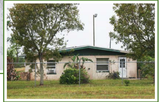
Office Building at Front of Property

Additional Photos Available on Our Website www.WaltersCo.com