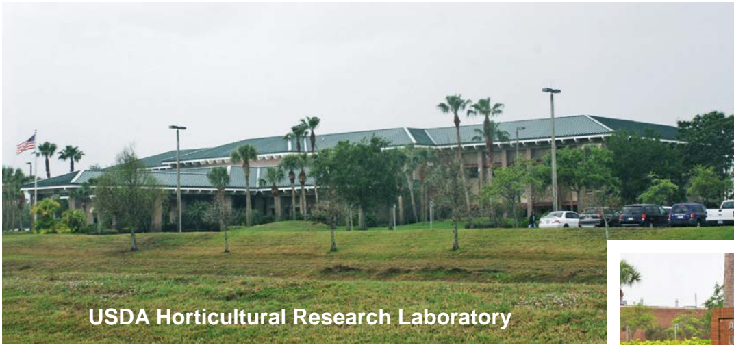
USDA Horticultural Research Laboratory